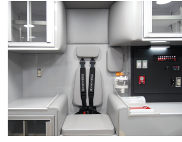
PADDED FOR PROTECTION