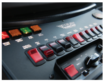
CUSTOMIZED SWITCH PANELS