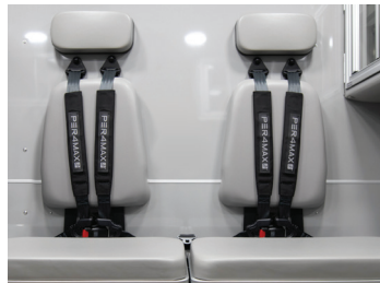
PER4MAX® SEAT BELTS