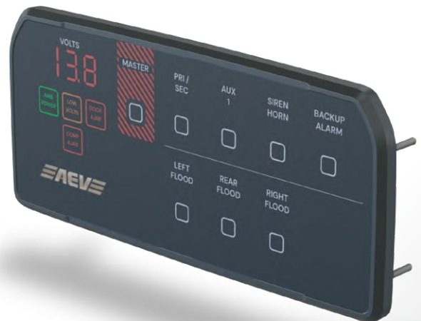
CAPTIVE MICROTUCH DISPLAY

AEV is putting you in control with the SSR Electrical System so you can focus on what's most important—keeping your vehicles on the road and protecting the lives entrusted to your care.